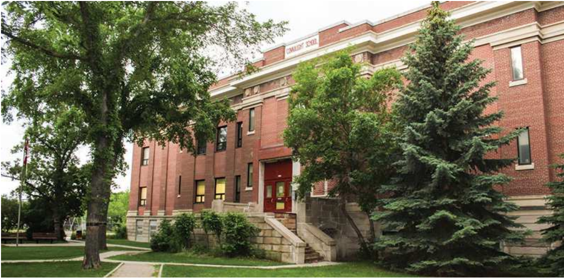
Connaught School (2013)