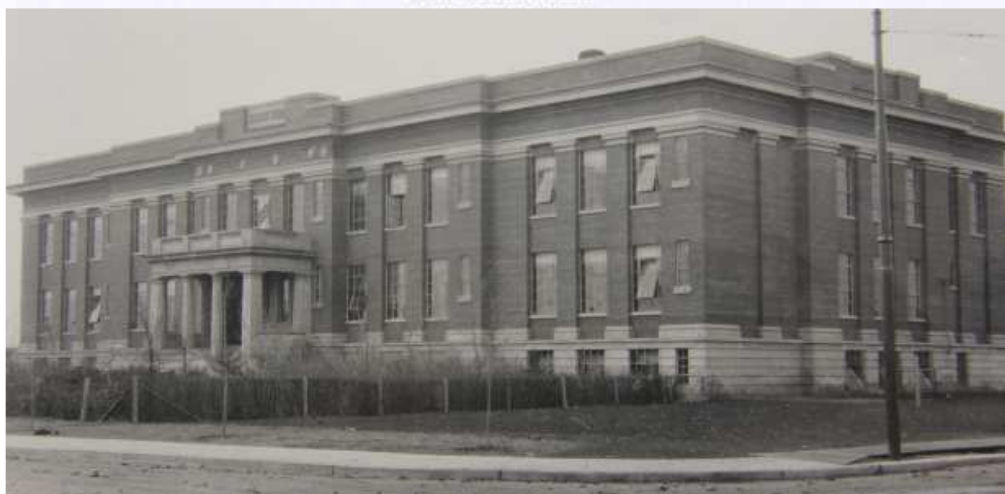
Connaught School soon after its completion.