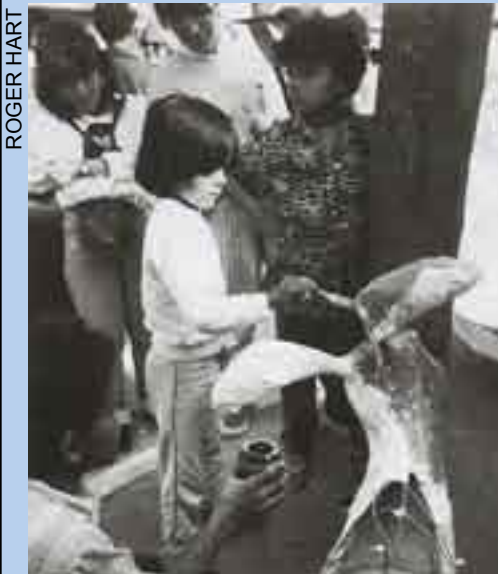
As part of a large scale programme to prevent children from falling into trouble in the streets, the Secretaria do Menor employs street workers to work with children in the streets of poor communities of Sao Paulo, Brazil. Here children are about to begin a parade through their community