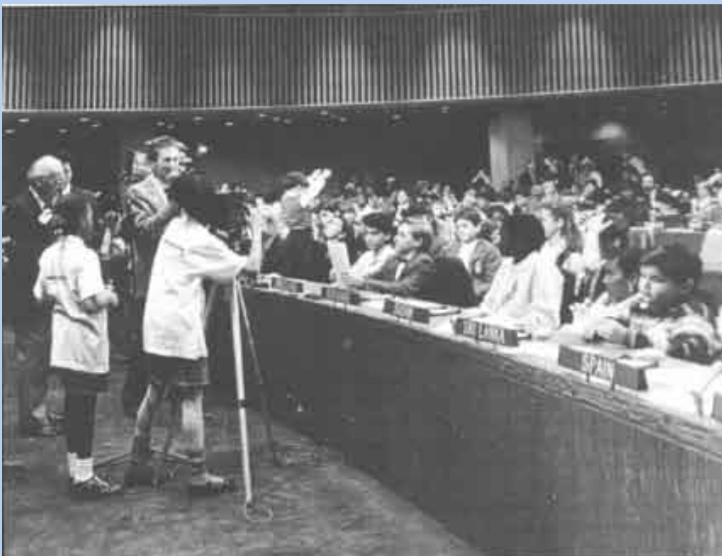
Students from Junior High School 125 in New York City record twelve-year-old Lemay-Thivierge, UNICEF's Spoke person for the Quebec Committee. He is speaking at the United Nations in New York following the adoption of the Convention on the Rights of the Child by the U.N. General Assembly