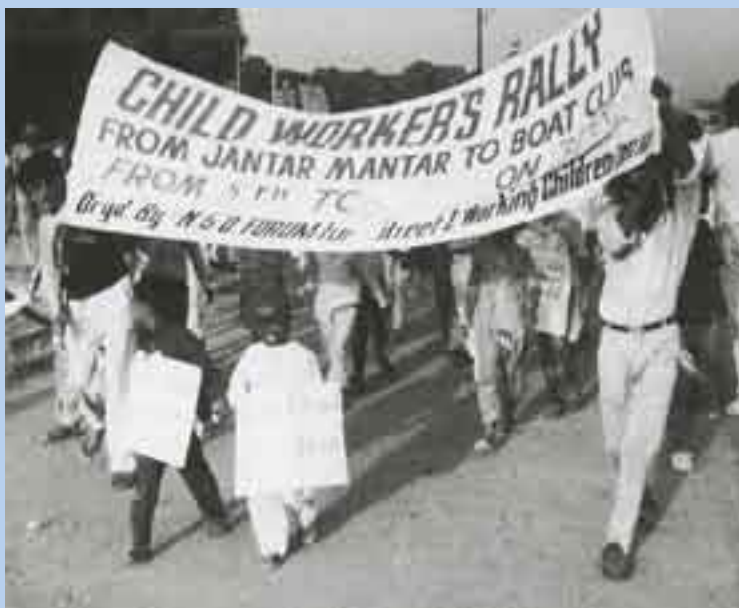
Street and working children demonstrating on their own behalf. This rally was organized by the NGO Forum for Street and Working Children in New Delhi, India.