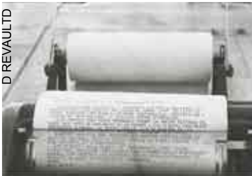
telex hook-up to agency network