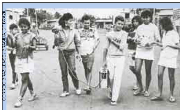
Teenagers in Paranoá, a low-income settlement outside Brasília, using a video system to document community problems as part of their school curriculum.

Meanwhile an approach, called Participatory Action Research, or sometimes just Participatory Research, was emerging for work with adults, particularly in developing countries. It is designed as an alternative to conventional applied research by helping people learn to conduct their own