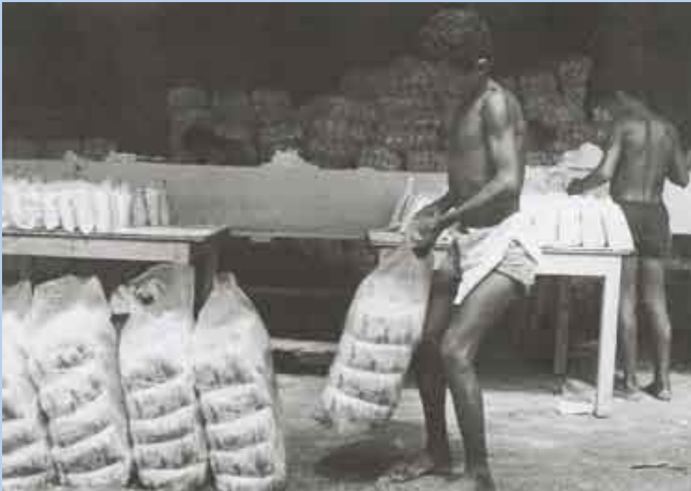
For most working children in the developing nations, their work is better called 'labour': It is not meaningful and they did not choose it.