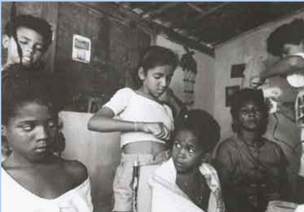
THE PASSAGE HOUSE, RECIFE, BRAZIL

Opportunities for meaningful work can serve as valuable preventative programmes for children living in families and communities where the risk of their turning to the streets is high. In this photograph from Recife, Brazil a woman has been given a small amount of money for equipment and supplies to run a hairdressing programme for girls. She also uses this opportunity to discuss health, AIDS, prostitution, schooling, and work in small informal discussion groups. The Passage House, which developed this programme, also manages homes for prostitute girls emphasizing a high degree of participation by the girls in projects designed to improve the lives of other prostitute girls.