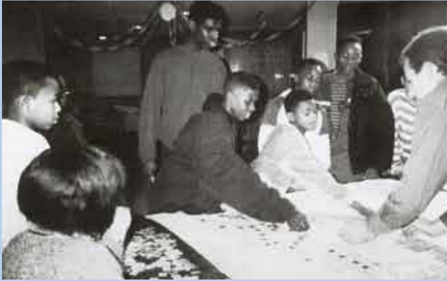
In an attempt to create safe play opportunities in the South Bronx, New York, the Children's Environments Research Group involved people of all ages in planning and design workshops. In this photograph young teenagers identify locations where the activities of drug dealers prevent their use of public open spaces.

research. A brief account of Participatory Research principles is necessary as an introduction to their specific application in research with children.