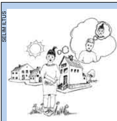
A critical phase in perspective-taking occurs between the ages of seven and twelve when a child becomes capable of putting herself 'in the other person's shoes'.

Self esteem is perhaps the most critical variable affecting a child's successful participation with others in a project. It is a value judgment children make about self-worth based upon their sense of competence in doing things and the approval of others as revealed by their acceptance as intimate friends. Children with low self esteem develop coping mechanisms which are more likely to distort how they communicate their thoughts and feelings; group interaction among these children is particularly difficult to achieve. Including a wide range of situations where these children can demonstrate competence can contribute to some improvement of self esteem.