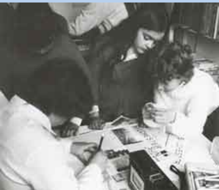
At the Notting Dale Urban Studies Centre, children put together an issue of the Silchester Sun, a community newspaper, using information collected from the community with the help of cameras and tape recorders.