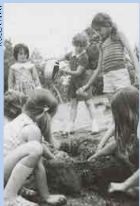
A dam with sluice pipes designed and built by girls in Wilmington, Vermont