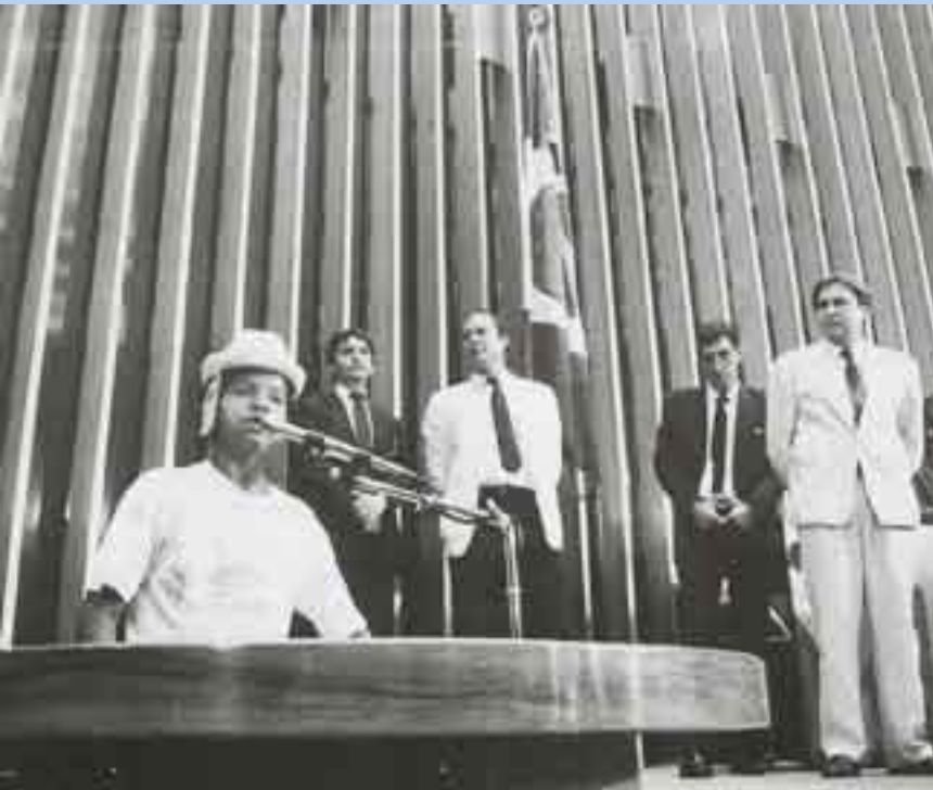
A youth addresses the Congress in Brasilia at the Second Congress of Street Children.