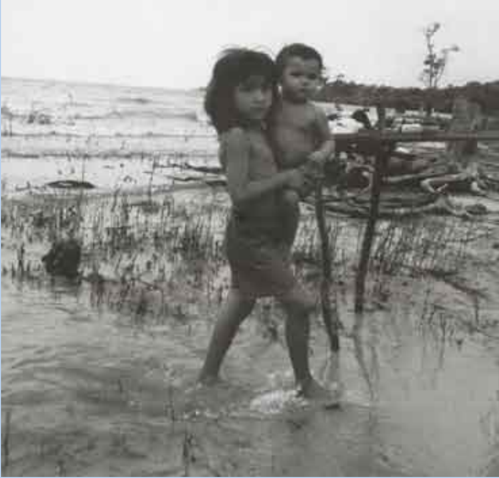
Girls from low-income families throughout the world, like this seven year old in Brazil, work from a very early age looking after children.