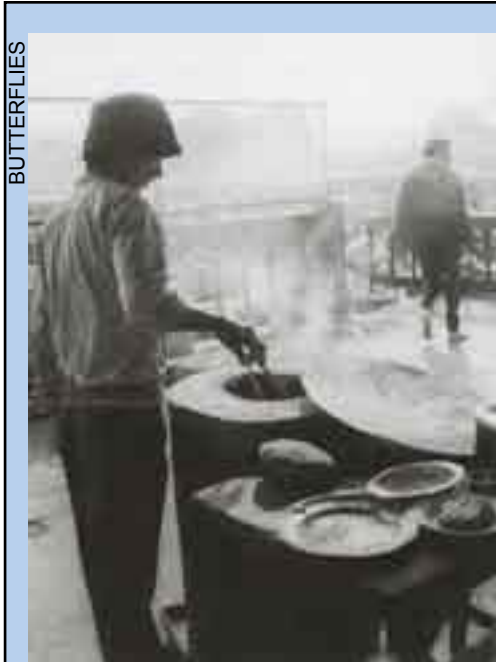
A youth working at Butterflies Restaurant located near the Inter-State Bus Terminals in New Delhi, India. Butterflies, a nongovernmental organization devoted to the lives of street and working children, founded this restaurant as a training centre, source of income, and home for a small number of homeless children and teenagers. At the same time, these young people serve other street children on a regular basis at a 40 per cent discount. A large sign on the front of the restaurant reads, "Managed by Street Children". Not surprisingly, the boys feared this would deter customers but they concluded that they need not hide their identity and the restaurant is surviving. There are hopes of extending the programme to a 'Meals on Wheels' for street children, also managed by street children.

Probably more important than the national events themselves, are the local organizations they have helped inspire. The local committees for street and working children, which are found throughout Brazil, offer opportunities for dialogue between the children, government agencies, and nongovernmental organizations (NGOs). There has been a steadily grow-