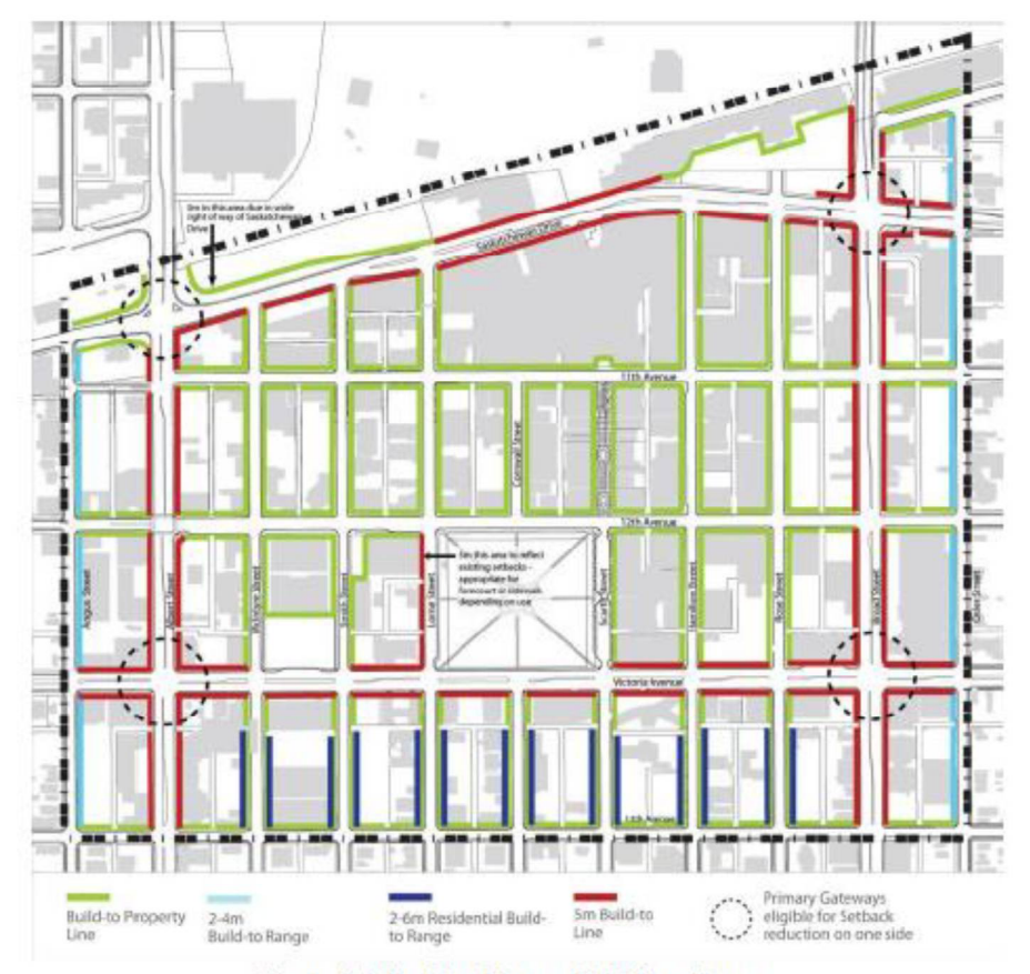
Figure 7.7: Build-to Lines and Build-to Ranges