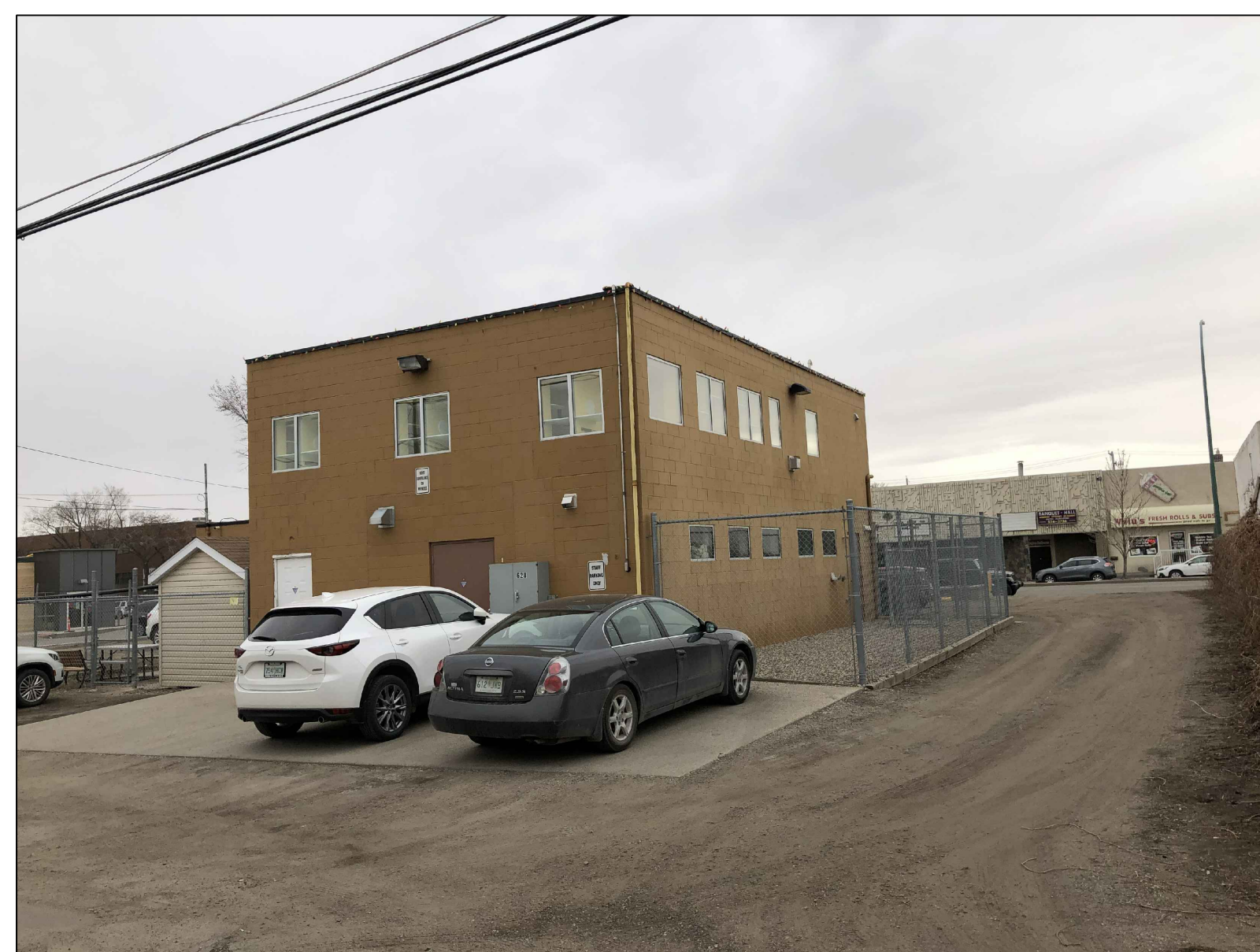
EXISTING PICTURE - NORTHWEST VIEW