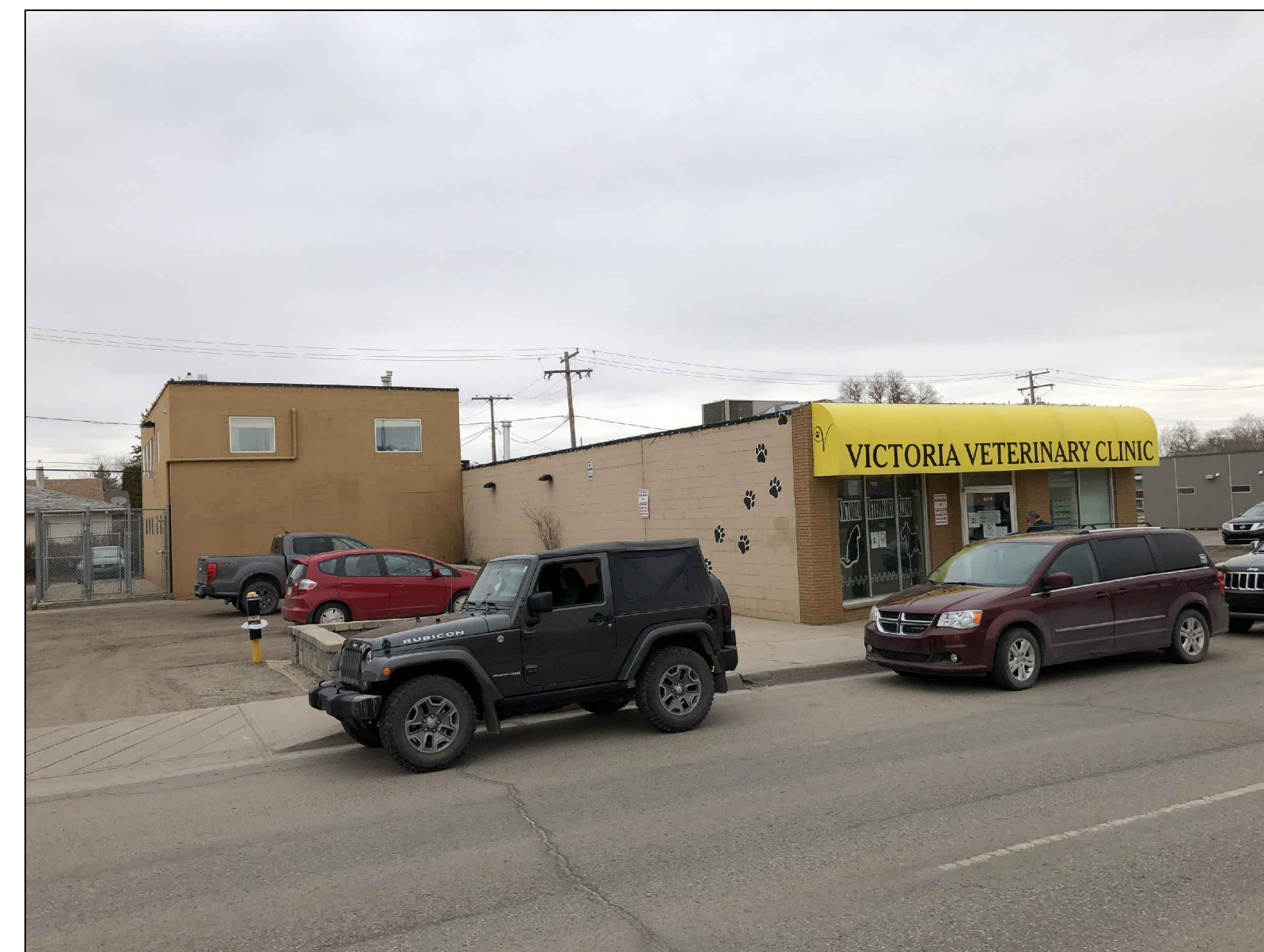
EXISTING PICTURE - SOUTHWEST VIEW