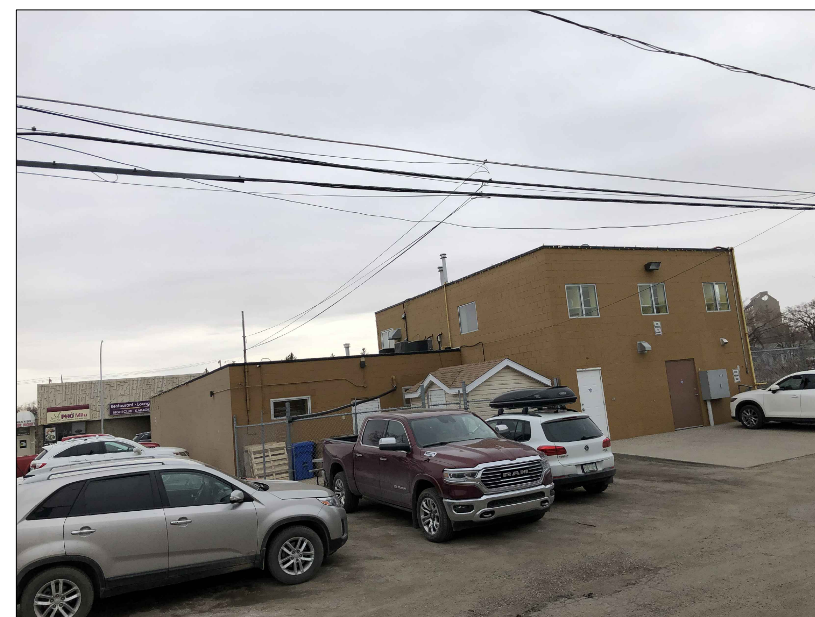
EXISTING PICTURE - NORTHEAST VIEW

2021.04.30 ISSUED FOR DISCRETIONARY USE R-0 DATE: ISSUANCE: REVISION: DRAWN BY: JOHN MCGINN STAMP: