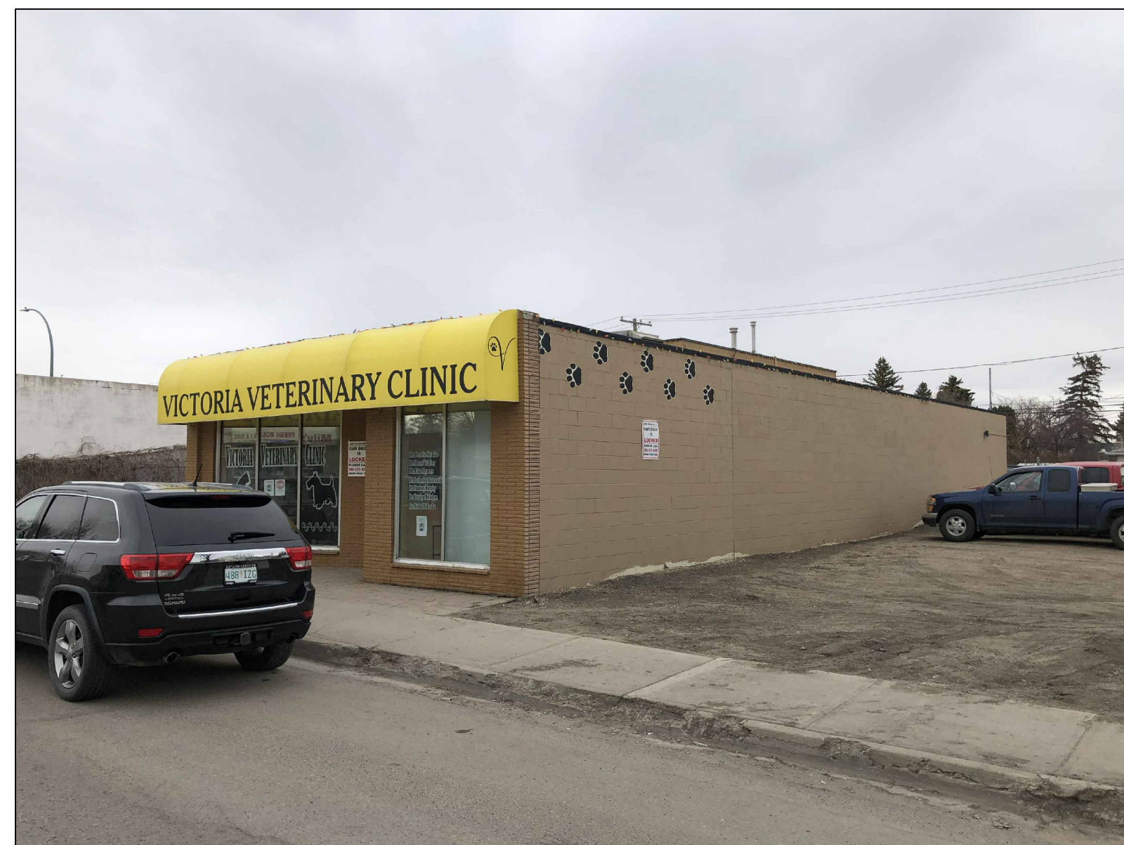
EXISTING PICTURE - SOUTHEAST VIEW