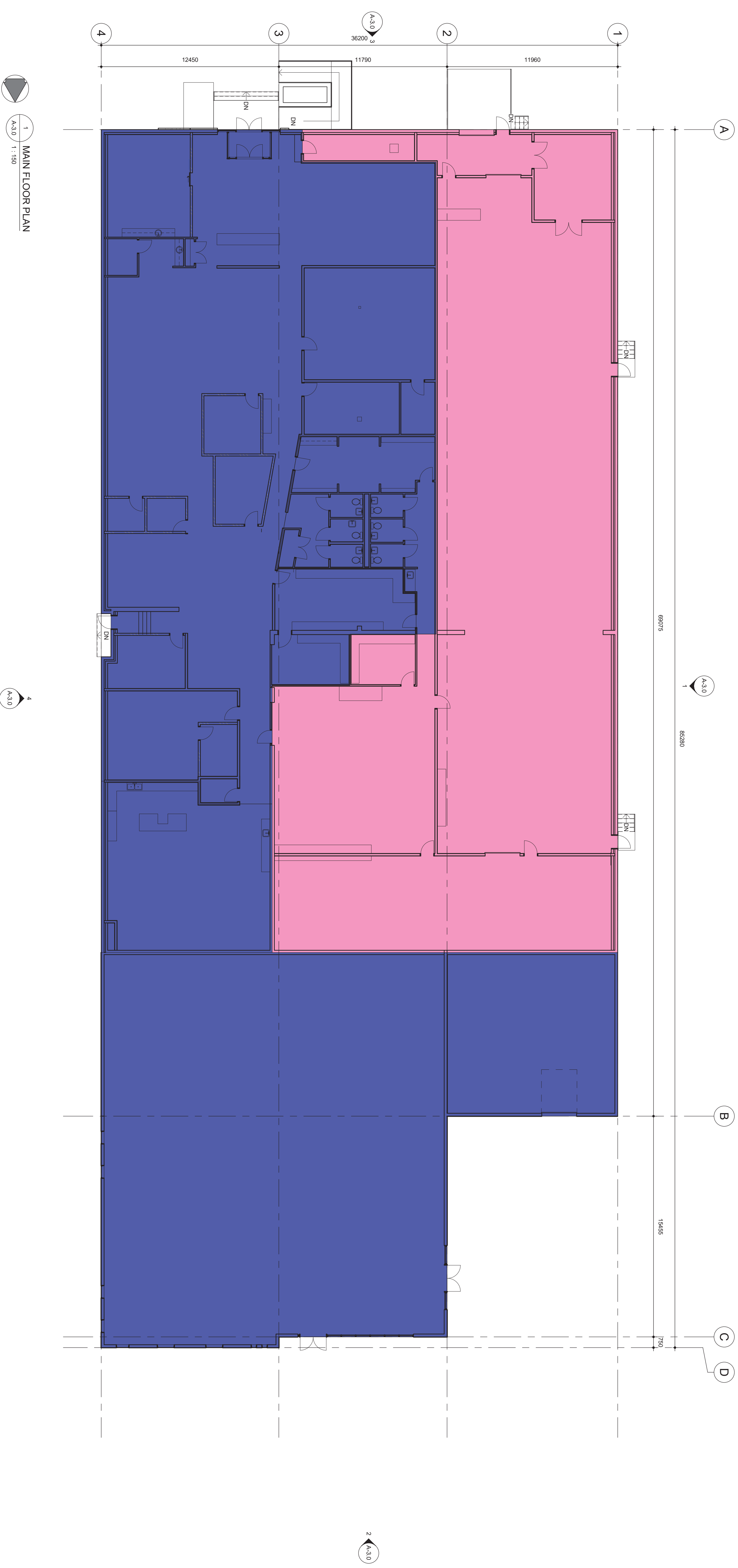
1 MAIN FLOOR PLAN A3.0 / 1:150