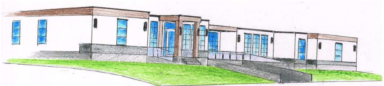
NORTHWEST ELEVATION – without trees