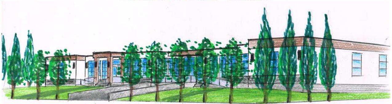
SOUTHWEST ELEVATION – with trees as a separation barrier