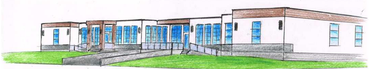
SOUTHWEST ELEVATION – without trees