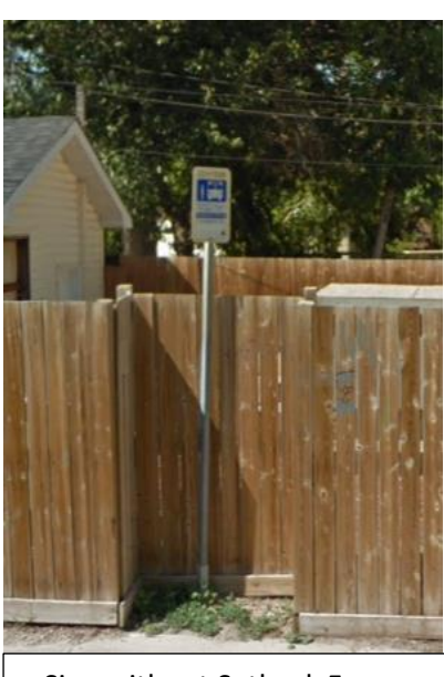
Sign without Setback Fence