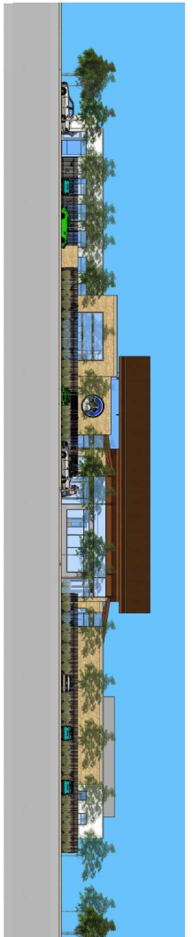
1 SOUTH ELEVATION - PROPOSED