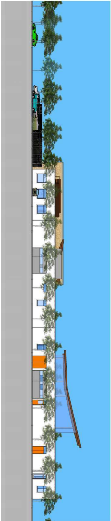
4 EAST ELEVATION - PROPOSED