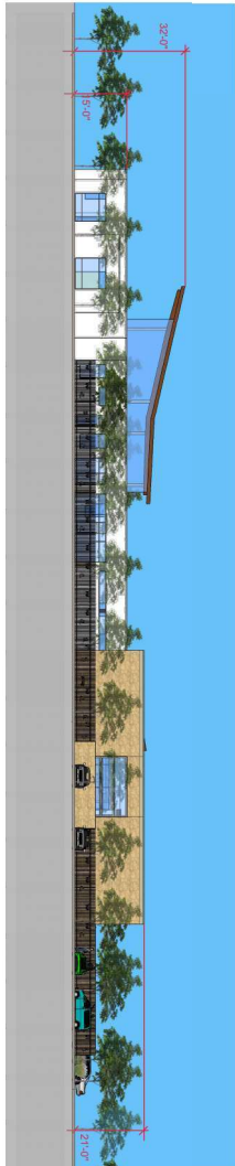
2 WEST ELEVATION - PROPOSED