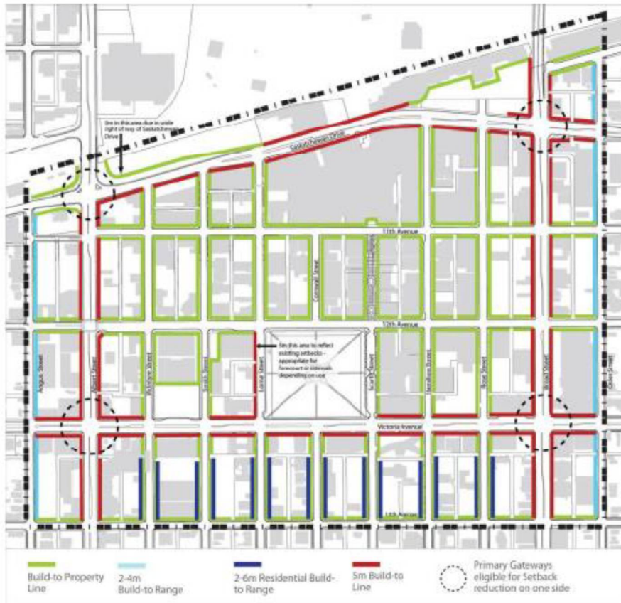
Figure 7.7: Build-to Lines and Build-to Ranges