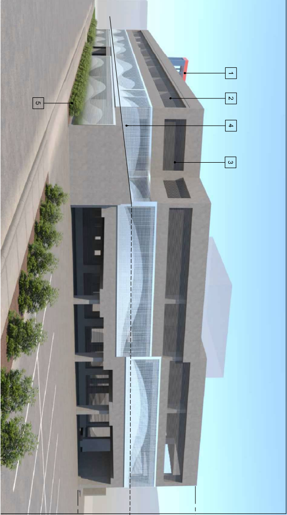
SOUTH ELEVATION - RENDER