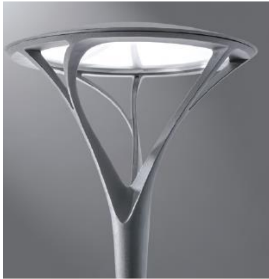
ARB ARBOR POST TOP

The new streetlight heads under review are a modern and simple design. They are like an upside-down saucer sitting on top of extended tree branches. The 'branches' are 3 sets of 2 where the 2 arms of each set 'branch off' in opposite directions in soft curves from the fixture base. The LED lights sit inside the upside-down saucer with a frosted glass cover. The LED lights only illuminate downwards to the street. This improves the intensity of the down lighting and does not create "light pollution" of the sky.