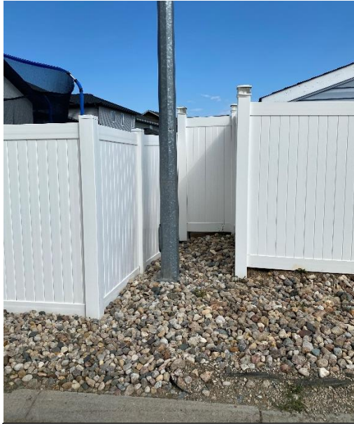
Streetlight pole: Proper Setback (R) Improper Setback (L)