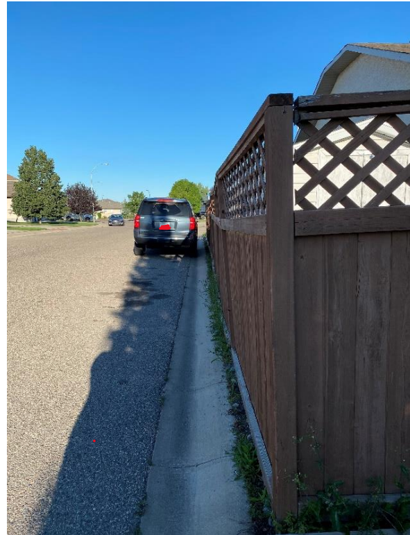
Fence in violation of Traffic Bylaw