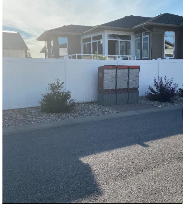
Mailbox with Fence setback