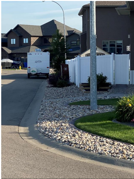
Fence in compliance with Traffic Bylaw

The picture below illustrates the proper setback of a fence on a street without a sidewalk. Car doors can be opened without obstruction and pedestrians can access the landscaped area for refuge and staging as needed.