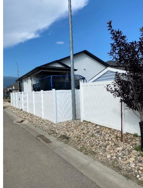
Improper Setback encroaches into streetlight placement