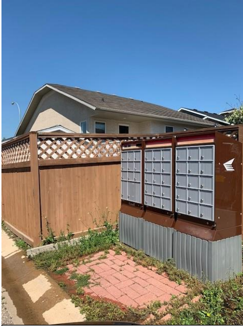
Mailbox near fence violation

The pictures below examples of a variety of infrastructure adjacent to the roadway near fences.