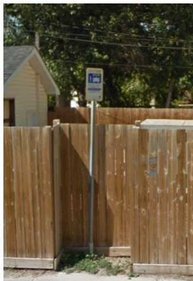
Sign without Setback Fence