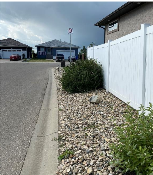
Sign Installation with Setback Fence