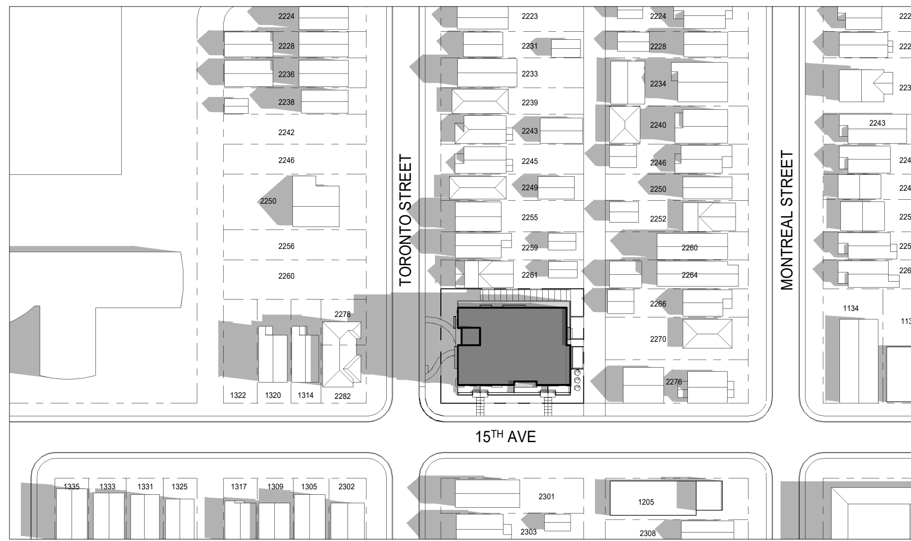
1 SUMMER SOLSTICE 9:00AM 1:1000

© ALL RIGHTS RESERVED THIS DRAWING IS NOT TO BE COPIED OR REVISED IN ANY MANNER WITHOUT THE WRITTEN AUTHORIZATION OF THE ARCHITECT. THE CONTRACTOR SHALL VERIFY AND BE RESPONSIBLE FOR ALL DIMENSIONS. DO NOT SCALE THE DRAWING. ANY ERRORS OR OMISSIONS SHALL BE REPORTED TO THE ARCHITECT WITHOUT DELAY.