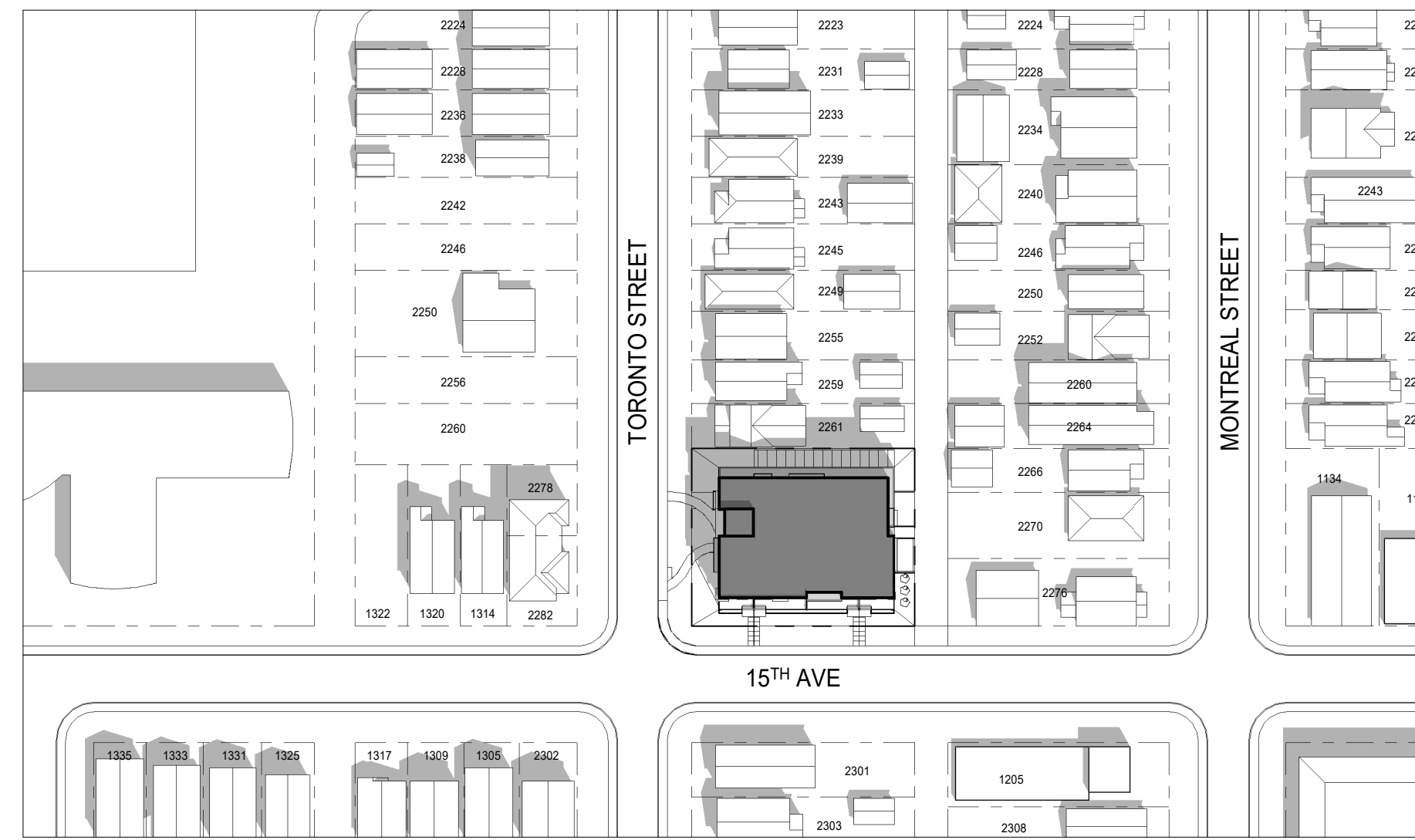
2 SUMMER SOLSTICE 12:00PM 1:1000