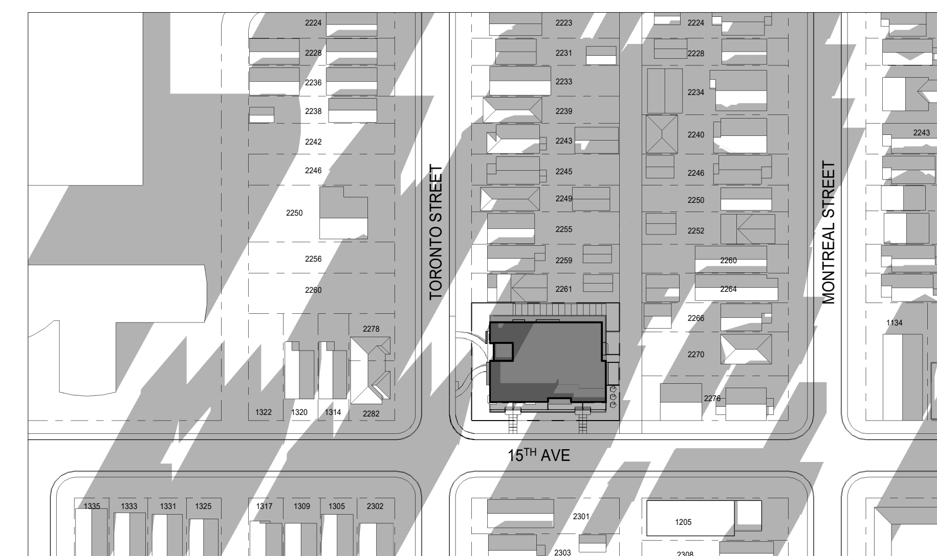
9 WINTER SOLSTICE 3:00PM 1:1000

PRELIMINARY FOR DISCUSSION PURPOSES ONLY