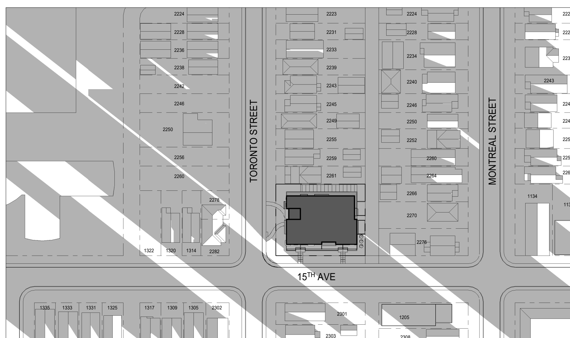
7 WINTER SOLSTICE 9:00AM 1:1000