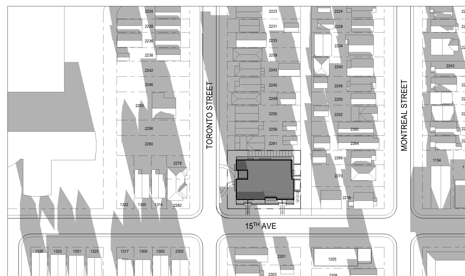
8 WINTER SOLSTICE 12:00PM 1:1000