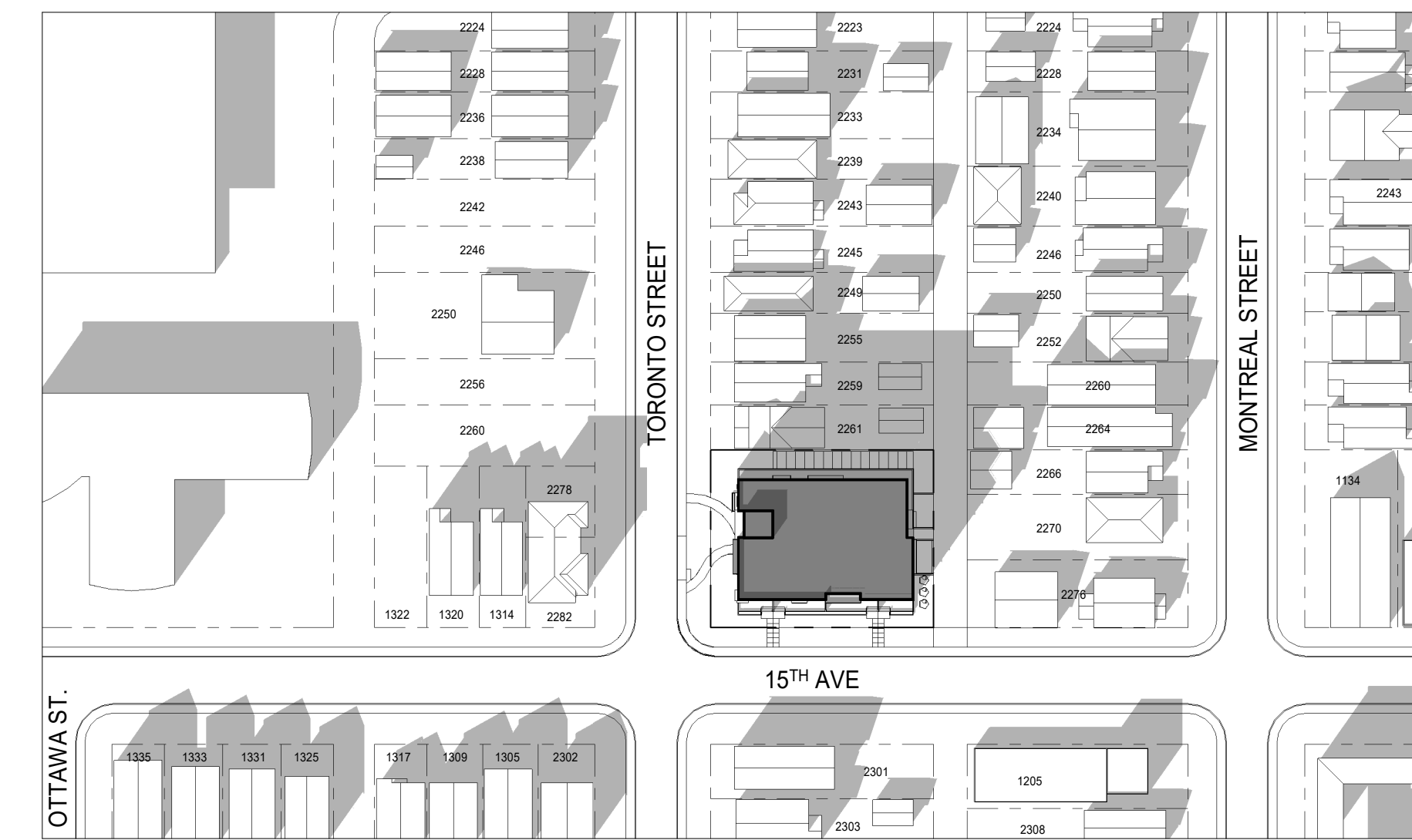
6 SPRING/FALL EQUINOX 3:00PM 1:1000