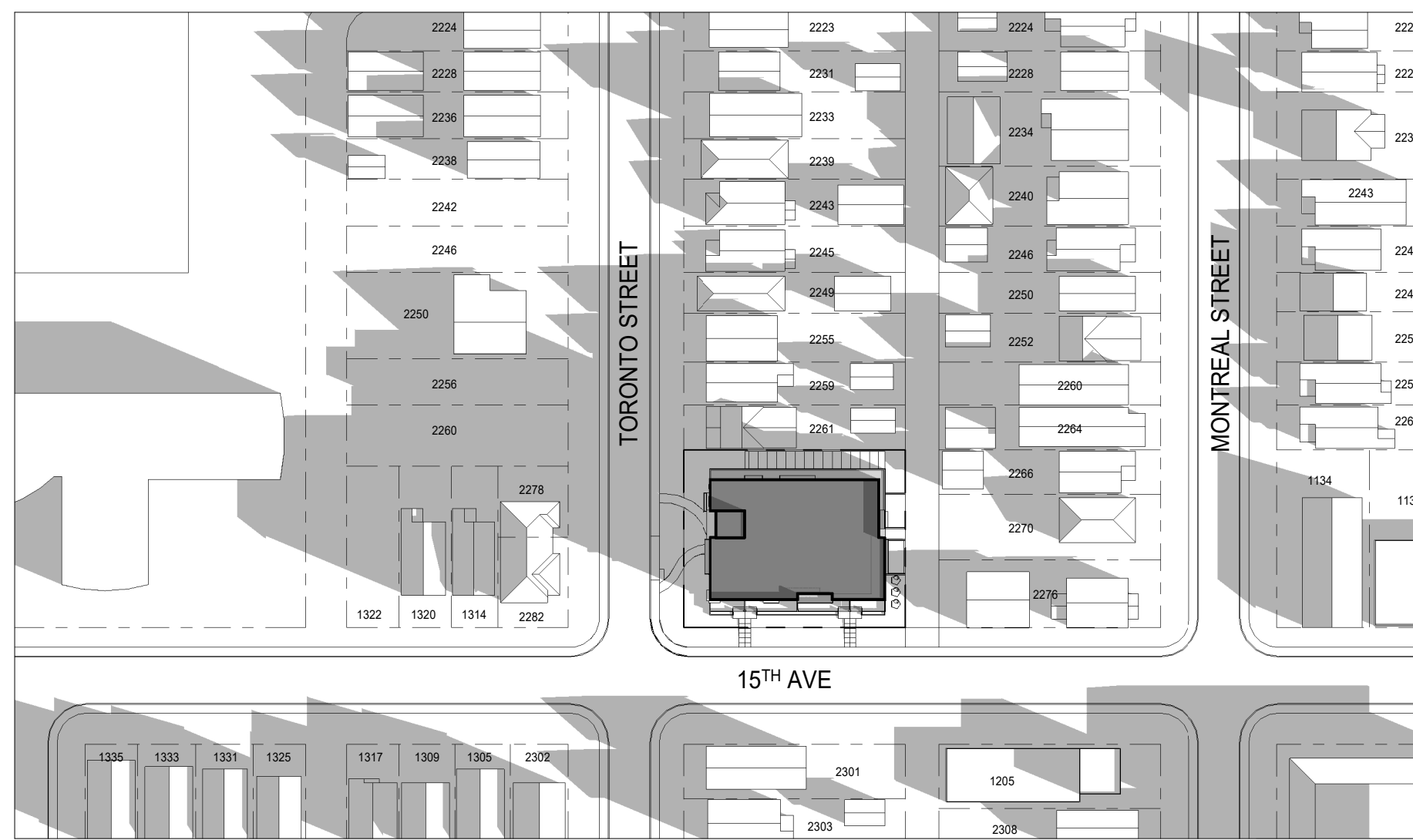
4 SPRING/FALL EQUINOX 9:00AM 1:1000